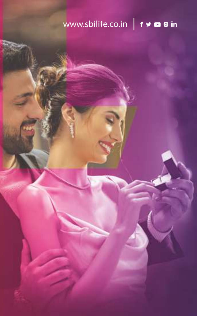
Chart your own path through life's milestones with money back at regular intervals